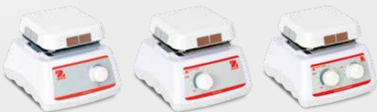
Stirrer (auto) HSMNAS4CAL