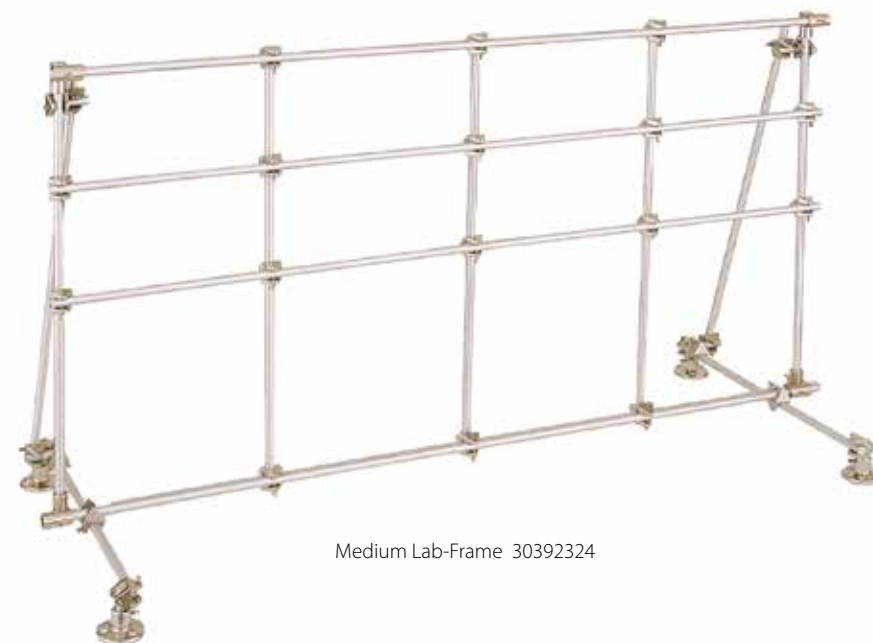
Medium Lab-Frame 30392324