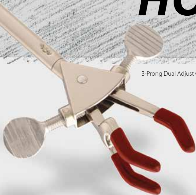
3-Prong Dual Adjust Clamp